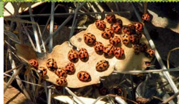
Greater on-farm biodiversity improves pest control by providing habitat for natural predators such as ladybird beetles.

Planting oil mallees provides both shelter and food for native wildlife. For example, many