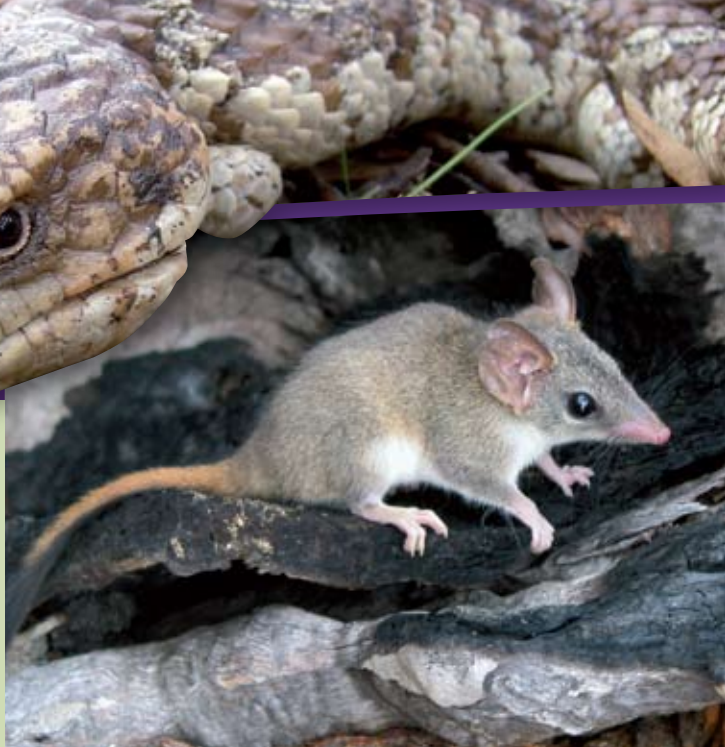
Oil mallees can provide additional habitat resources for native animals such as the Bobtail lizard and the Red-tailed phascogale.