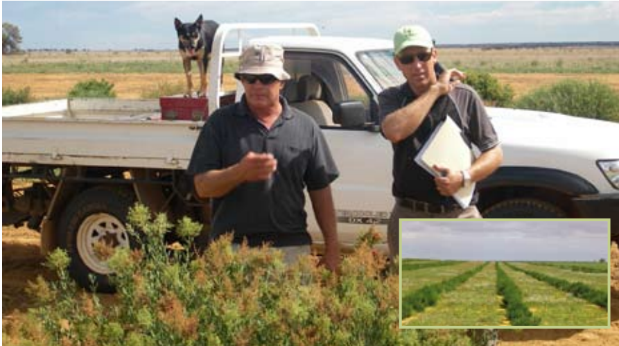
Shrubs such as Rhagodia help drought-proof Don's farm. INSET: A 54 hectare Tagasaste plantation planted during 2004 on high, wind-blown country. The paddock has been heavily stocked but there is no evidence of erosion.